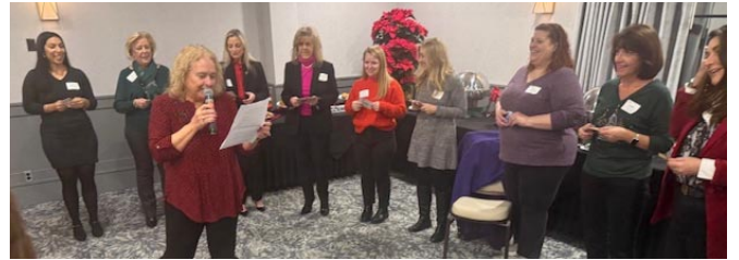
Great food, great company, great connections! On December 10th, the WIBI group of the mrcc gathered at the Crowne Plaza Suffern-Mahwah for their annual Holiday Breakfast, enjoying festive networking and fun holiday games to celebrate the season together.