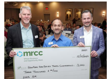
The 5K Race raised funds for the NY-NJ Trail Conference.