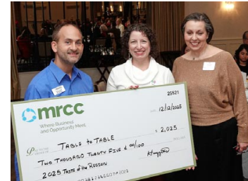
Table to Table benefitted from donations at the Taste of the Region.