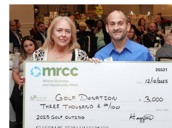
Both Bergen Volunteer Medical Initiative (BVMI) and Pony Power Therapies benefited from our Golf Outing