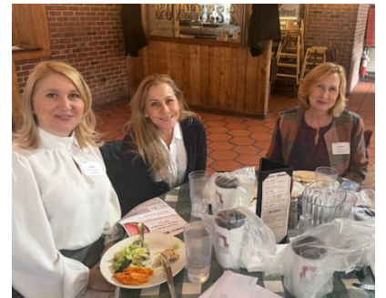
On January 21st, our WIBI group gathered at the Mason Jar for a networking lunch to kick off 2026, making great connections and setting the tone for a strong year ahead.